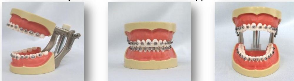
Ideal training tool for wire, lingature wire, elastomer setting and its removal or for patient education after setting.