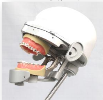
ADEM Phantom Kit