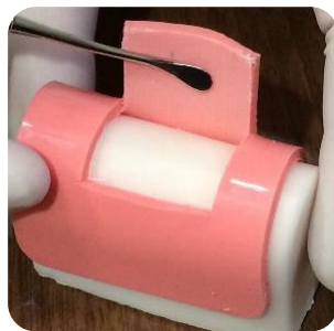
Partial thickness flap and Full thickness flap (Photo attached)