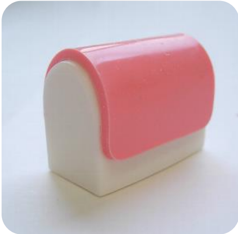
Thickness of Gingivae: 2.0mm Size: 48mm(L)x22mm(W)x37mm(H)

Ope-Block is compact designed disposable traing model for implant drilling, incisional and sutural practices. This handy small block reproduce three-layer structure, presuming alveolar bone, periosteum, gingivae.