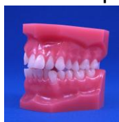
【DEMAL-002】 Class 1 case