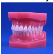
【DEMAL-001】 Ideal arch