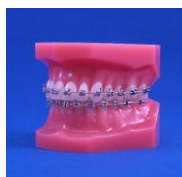
【DEORT-001】 With metal brackets