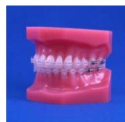
【DEORT-003】 With ceramic brackets

Any type of malocclusion models are available.