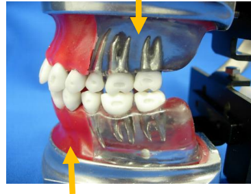
Anteriors and 1st. bicuspid portion is soft wax form.