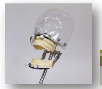
Fixed into ADEM Simple Manikin Head

Available as ADEM Head or Simple Manikin Options