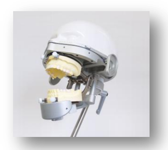
Fixed into ADEM Phantom Head

Upper and lower plaster model with ADEM teeth mounted to metal tray articulator. Articulator and mounted metal tray is also available for sale.